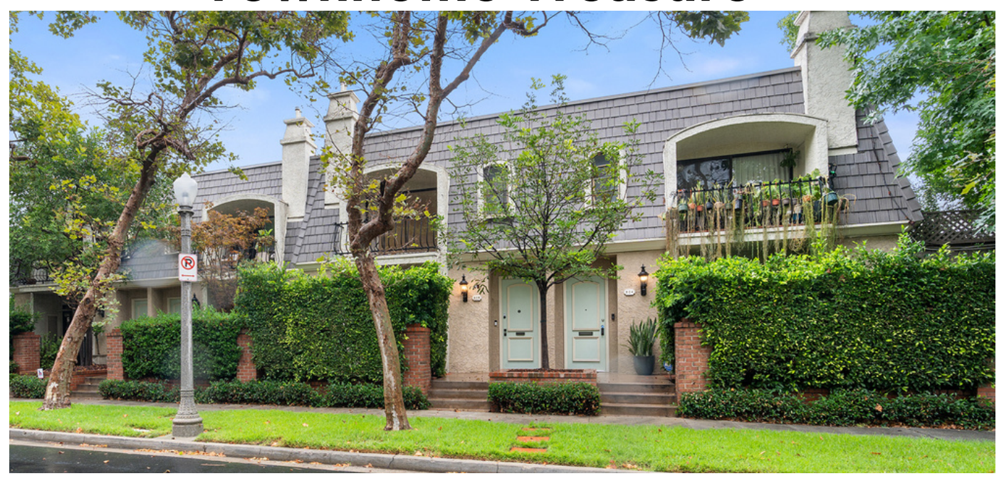
606 Wilcox Ave, Los Angeles, CA 90024

Townhome Treasure in Wilshire Country Manor! Located in Hancock Park and a stone's throw to Wilshire Country Club and LA Tennis Club, this splendid 3 Bed 2.5 bath unit is ready for a Buyer to move right in! Walk into a light filled entry with living room and a fireplace. Then present into a kitchen that is open and fresh with newer stainless-steel appliances. There is counter seating and an abundance of space in the dining area. There are two private outdoor patios - one off the living room and the other, off the kitchen breakfast area. Upstairs are 3 bedrooms, two bathrooms and laundry space. The primary bedroom has an ensuite bathroom with double sink vanity, a walk-in closet, and private balcony. The townhome complex amenities boast a pool, community room, and ample guest parking. There is gated resident parking with two parking spaces designated to the unit. Larchmont Village eateries and shops are close by - walk or drive. HOA dues cover landscaping, pool maintenance and an on-call 24/7 security service.